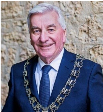
Chairperson Mayor Keith Parkes

The 2023-25 SA Coastal Councils Alliance Executive Committee consists of the following members.