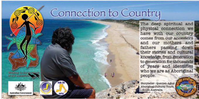
Loss of Narungga cultural heritage