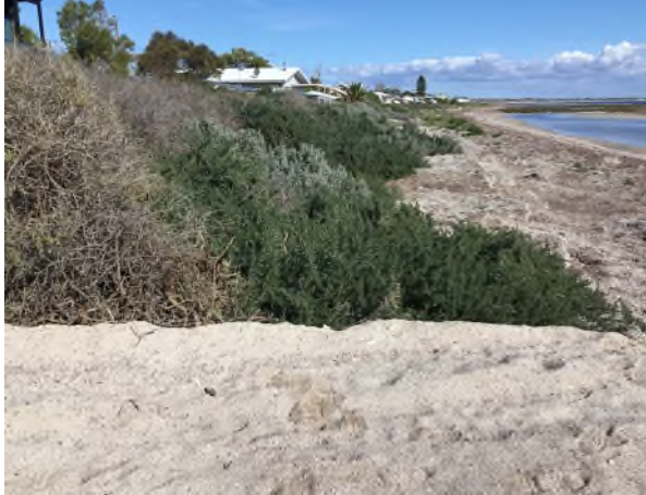
Removal of vegetation