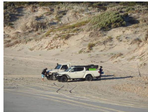
Impacts to threatened species